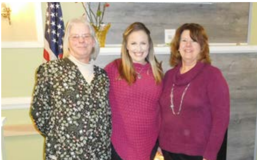
District Staff at the holiday and awards dinner.

The Tidewater Soil and Water Conservation District Board of Directors conducted monthly business meetings with local partners, such as, the Department of Conservation & Recreation, Virginia Cooperative Extension, Virginia Department of Forestry, Natural Resource Conservation Service, and the Farm Service Agency.