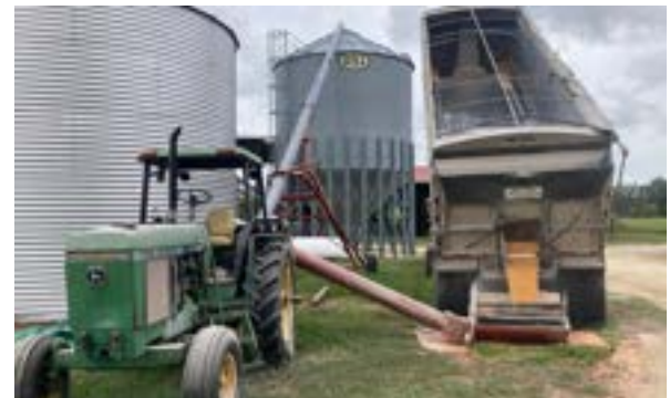
The harvest is unloaded into the grain elevator at the farm.