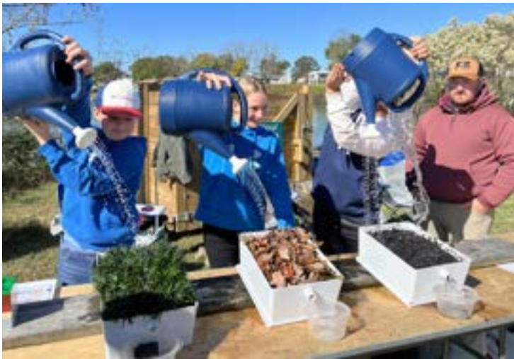
Middlesex Elementary students simulate rainfall over the erosion boxes using watering cans to demonstrate the impact of water erosion.