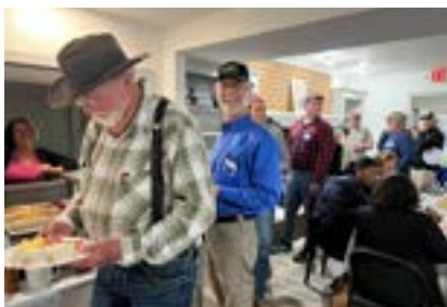
Attendees enjoy an all-you-can-eat buffet breakfast.