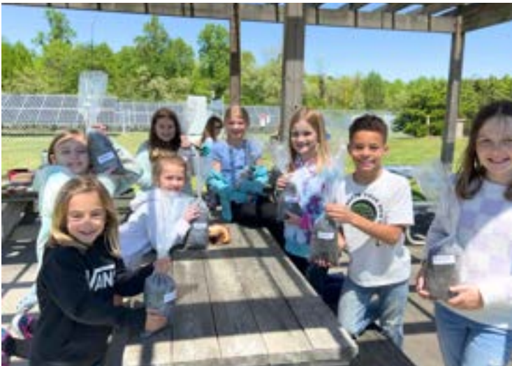
Middlesex Elementary students show off their Eastern Redbud seedlings they planted.

Tidewater SWCD partnered with the Virginia Department of Forestry (VDOF) to celebrate Arbor and Earth Day by providing educational programs to 507 students at seven local elementary schools . Each student planted an Eastern Redbud seedling to take home and participated in an interactive program on the environmental benefits of trees led by local VDOF Forester, Lisa Deaton.