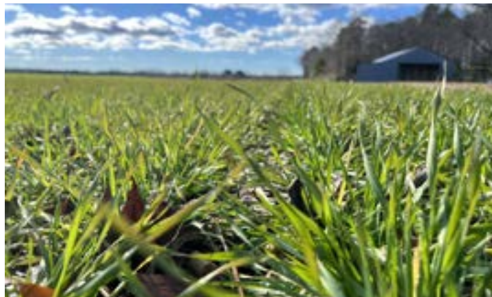
Cover crops emerge on Corbin Hall Farm in Middlesex County

23,775.34 total acres included on nutrient management plans written by DCR or by a certified plan writer through the Department of Conservation and Recreation's Nutrient Management Direct Pay Program.