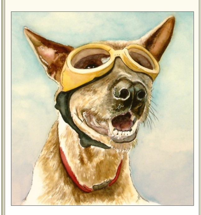
"I can see it, but I still need your help to scoop it!"