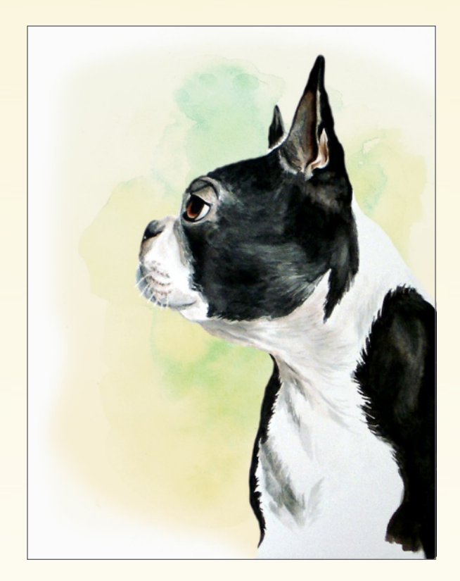
"Thanks for helping me be more neighborly."

Like human waste, animal waste may contain harmful bacteria and viruses, rendering the water unfit for recreation or other uses. It takes only one teaspoon of dog feces in a water body the size of an Olympic pool to make the water unsafe for swimming. Pet waste also contains nutrients that will accelerate the growth of nuisance algae in creeks and lakes. Excess nutrients are a major cause of the decline of the Chesapeake Bay.