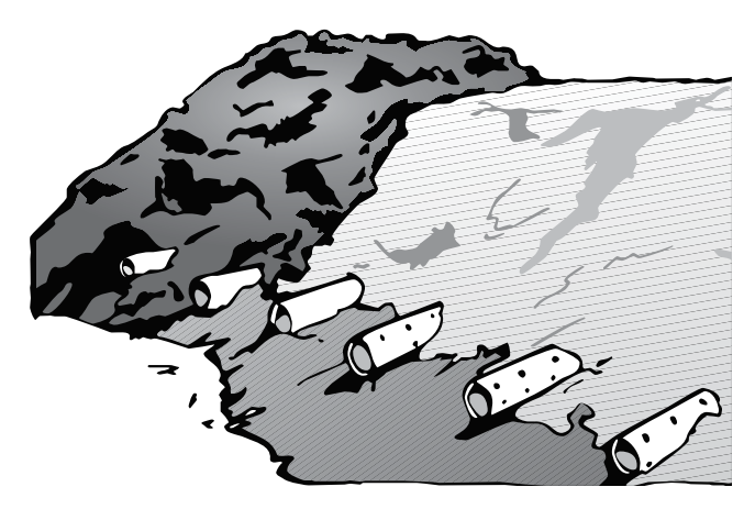
Aerated static pile with perforated PVC pipes.

Compost-pile design and storage facilities will depend on the size of the operation and the equipment available. For a farm with two to six horses, small static piles, which use perforated PVC pipes to draw in air and don't require turning, may be ideal. While not necessary, the use of multiple bins can allow separation of distinct "batches." In this situation, horse manure should be piled approximately five to eight feet high with a base that is two times the width and length of the height. For example, a 10-foot-by-10-foot bin could accommodate a pile that is five feet high. PVC pipes should be placed after the pile is about one foot high and so that the ends remain visible as more manure is added.